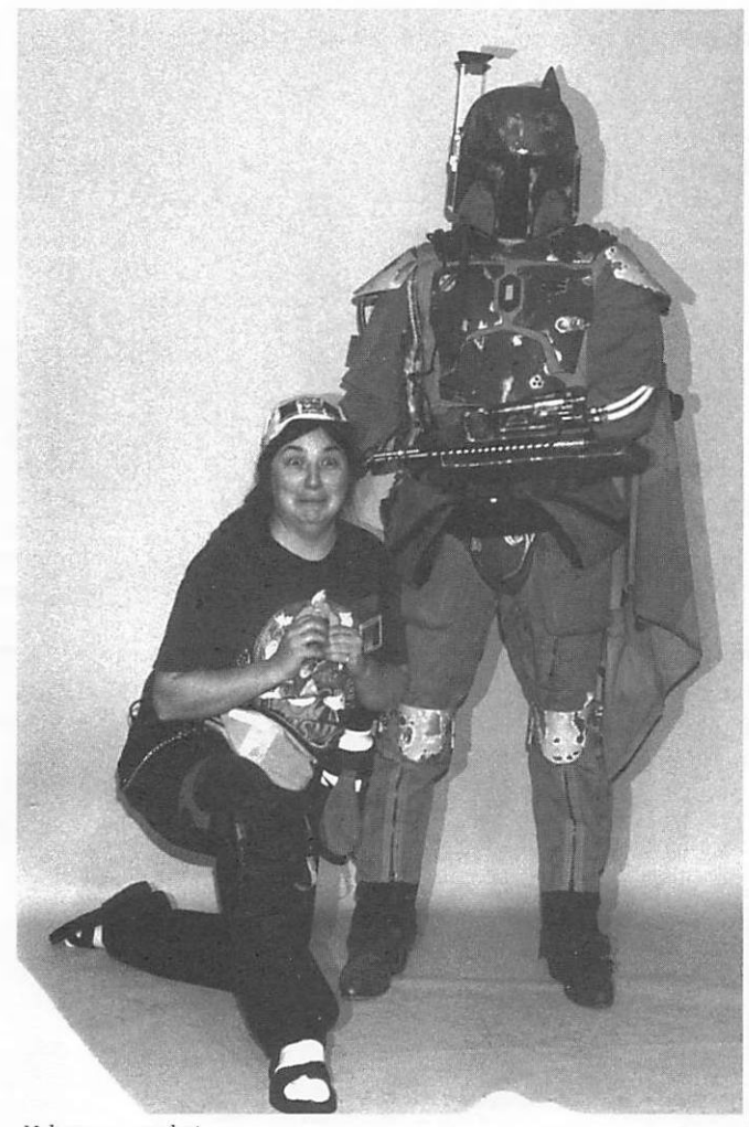
Volunteer... or else!